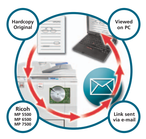
Transmit scanned data without burdening the network using Scan-to-URL.